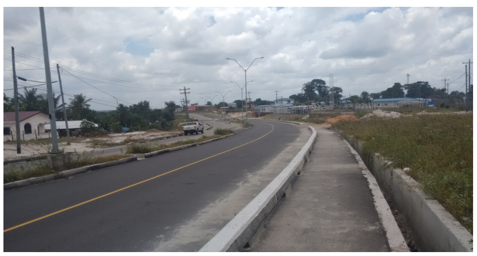
Fig. 5 - New Access Road substantially completed (March 2016)

76. Physical inspection was conducted in March 2016 and the road was substantially completed, as shown in Figure 5 below.