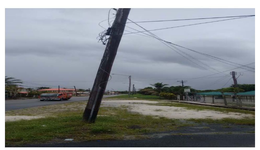
Fig. 6 - Utility pole in path of incomplete roadway (15 September 2016)

78. We must conclude that had the Ministry enforced the requirement for the contractor to submit a detailed work programme and revised programmes as the need arose, measures could have been in place to better monitor the execution of the works as it progressed and corrective action could have been taken for any slippage on the project deadlines.