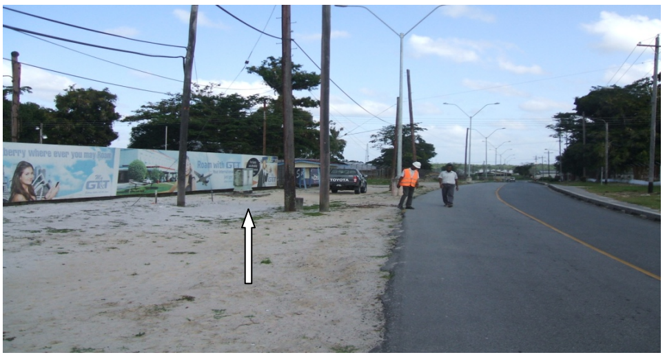
Fig. 4 - Poles and junction box in path of roadway (February 2014)

72. A follow-up inspection visit in February 2014 revealed that the utility poles and the GT&T's junction box were still in the path of the roadway, as shown in Figure 4 below.