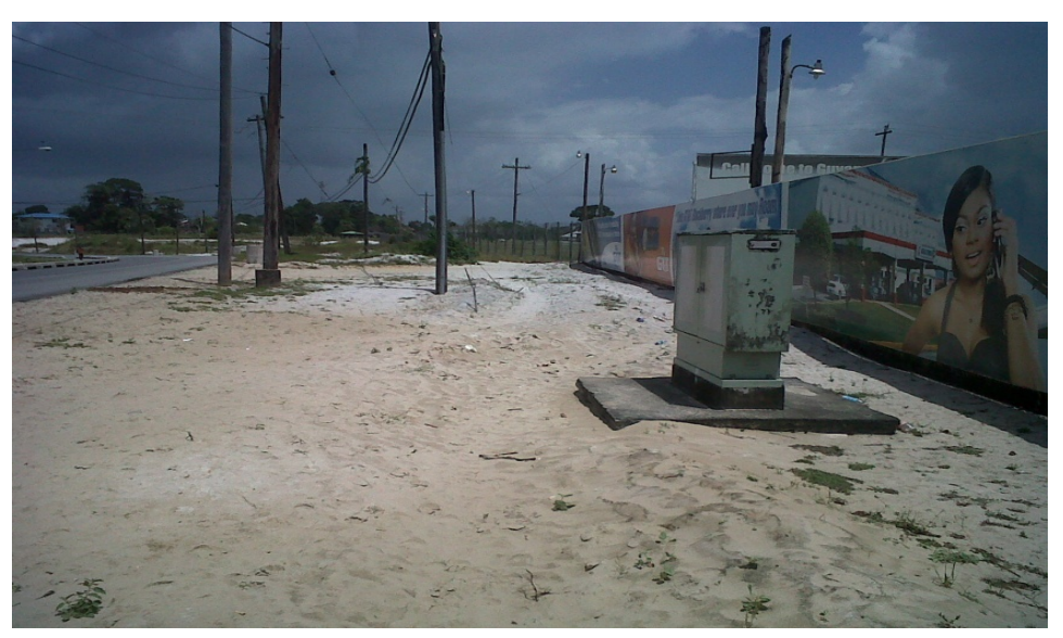
Fig. 3 - Poles & junction box in path of the road construction (March 2013)